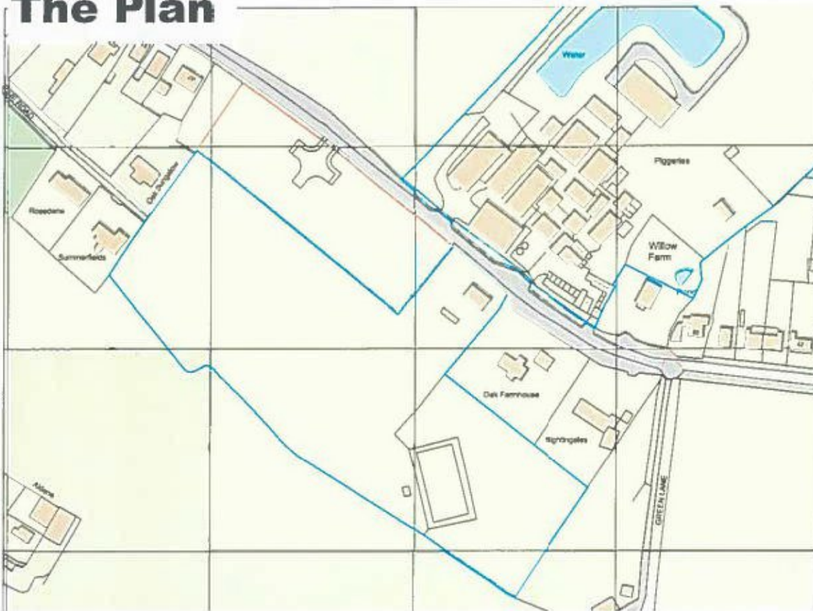
Site Location Plan 1:1250 @ A3

Land to South of Mill Lane Willow Farm Wesley Heath CO16 9EZ