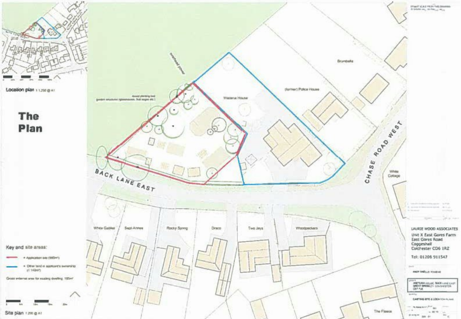
Location plan 1:1250 @ A1