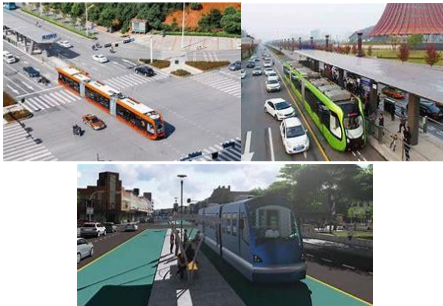
Examples of rapid transit solutions and the desired level of segregation

trackless trams would co-ordinate with automated pods to take passengers to final destinations.