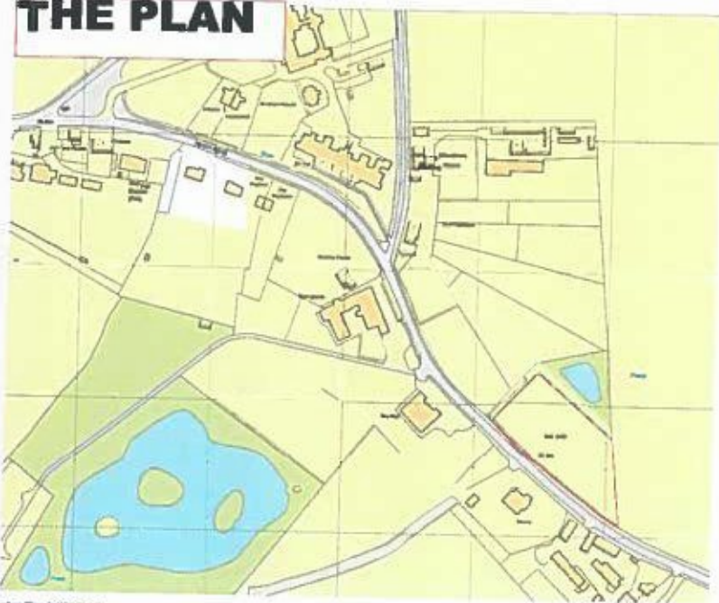
Location Plan 1:1250 @ A1