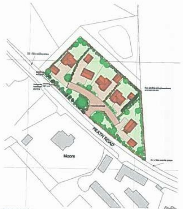
Illustrative Layout @ A1