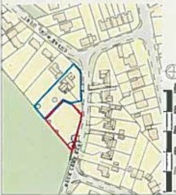
Location plan 1:1,250 @ A1